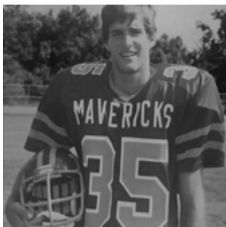
PLAYING ON A SWEET SENSE OF NOSTALGIA, THE INSPIRATION FOR THE NAME COMES FROM COOPMAN'S JERSEY NUMBER.

So raise a glass of champagne and let the soft strains of a jazz serenade as it becomes evident that The 35 Bistro is not just a restaurant; it is a living tribute to a love that transcends time..