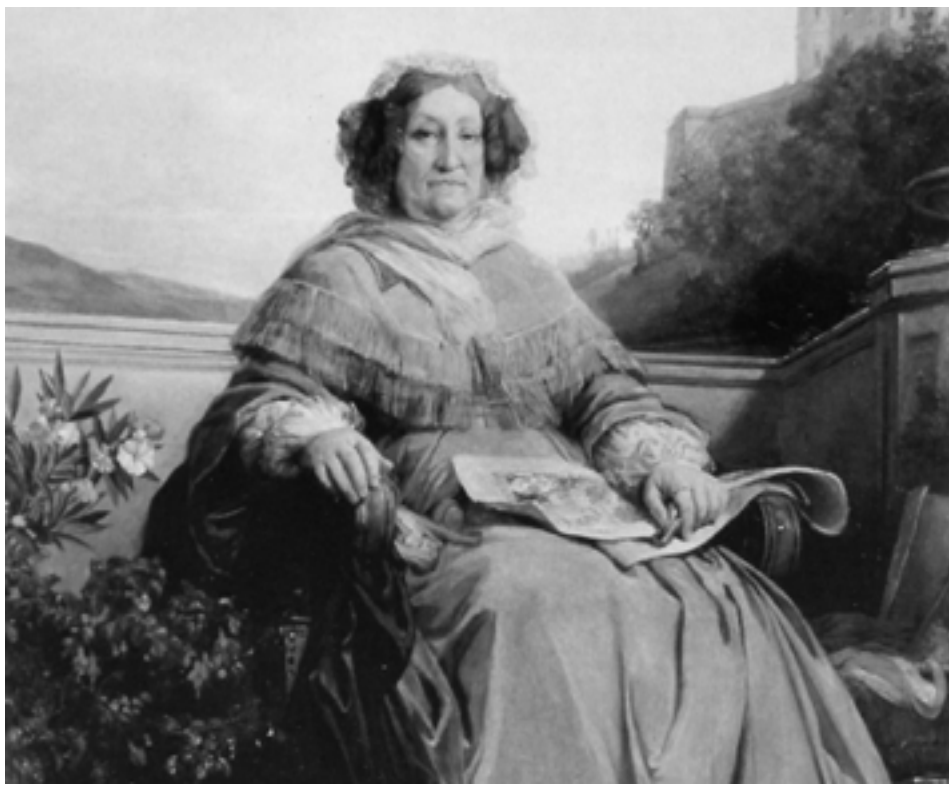
"Madame Clicquot, the 'Grande Dame of Champagne,' revolutionized the champagne industry."

Under her leadership, the House of Clicquot flourished, transforming from a modest family business into a global brand synonymous with luxury and elegance. By the time she passed away in 1866, Madame Clicquot had not only secured her legacy but had also paved the way for future generations of women in the business world.